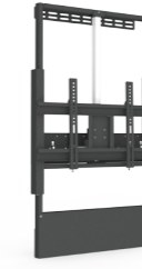
Motorised Wall Bracket