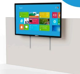
Motorised In-Wall Bracket CBMTRIW103